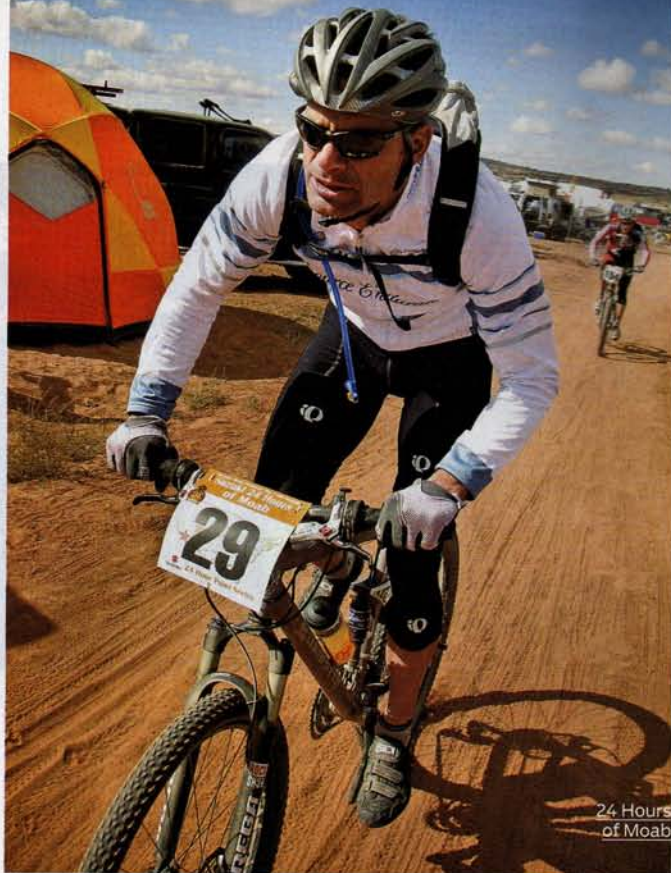
24 Hours of Moab