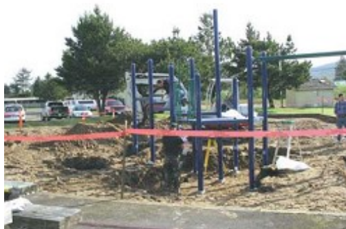
Phase one of an update to Cartwright Park occurred Saturday in Seaside and included the building of a large central toy as well as the installation of swings and benches.

Wallace said the city was also working on repairing the irrigation system and hoping to get two small soccer goals for a mini soccer field in the large grassy area of the park.